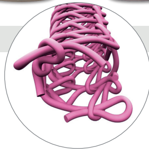
Aluminum chloride (AlCl 3 · 6H 2 O)